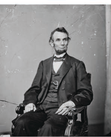
Anthony Berger's iconic photograph of Lincoln from the winter of 1864.