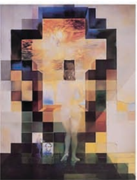
Salvador Dalí Spanish, 1904-1989