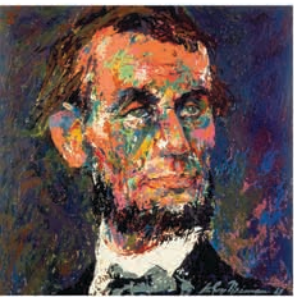
LeRoy Neiman American, 1921-2012