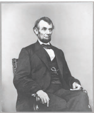
1864 portrait of Lincoln by Anthony Berger from the same sitting as the portrait above.

Originally commissioned as an oil painting, Neiman reproduced the image by serigraph, or screenprinting, in the 1970s, offering a limited edition of 750 copies.