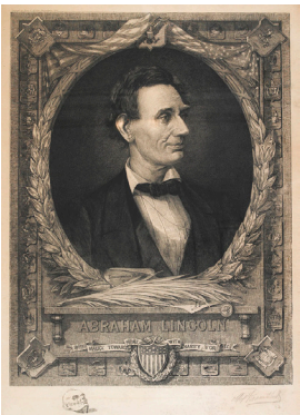
Max Rosenthal Polish, 1833-1918 Abraham Lincoln , 1908 Etching A97.578

Rosenthal, who immigrated to the US in 1849, worked extensively as an artist in lithography, engraving, and etchings. In the years after 1884 he completed more than 150 etchings featuring portraits of prominent Americans and British officers.